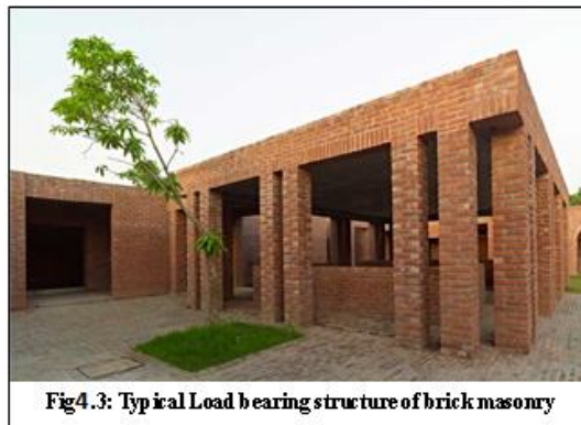
Fig4.3: Typical Load bearing structure of brick masonry

Load-bearing wall systems play a crucial role in distributing vertical loads from floors, roofs, and other structural elements to the foundation. These walls are strategically placed based on engineering and architectural designs to ensure structural stability and overall support for the building. They contribute significantly to the building's strength, stability, and resistance against various forces, making them integral components in the construction of safe and durable structures.