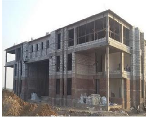
Fig.4.4: Typical RCC Framed Structure